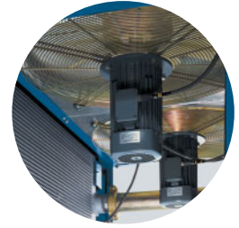
Package cooling fan. The cool air passing through the unit picks up all radiant heat