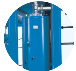
Large reclaimers with generously-sized fine separator elements, large oil coolers and aftercoolers