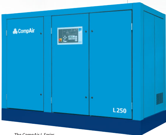
The CompAir L Series. A high capacity air compressor range that sets the highest standards in reliable, economical and efficient operation.

Ongoing investment in the latest design and manufacturing tools, and rigorous implementation of ISO 9001 approved quality systems, ensures you take delivery of a reliable, high quality product.