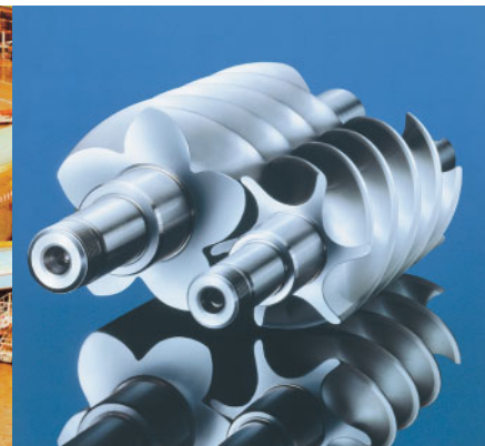
The CompAir screw profile - the result of continuous research and development