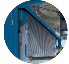
The large aftercooler effectively cools compressed air and is easily accessible for maintenance