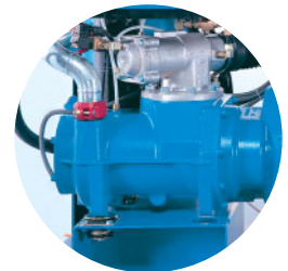
The high capacity compression element, with low rotor-tip speeds, gives high efficiency with maximum reliability